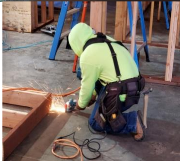
Worker cuts metal bolt from concrete floor